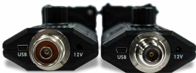
RF Connectors N Male and N Female